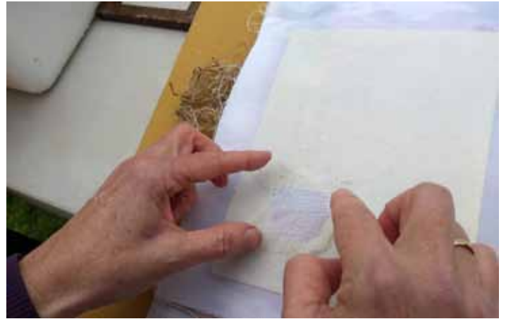
Putting in a window