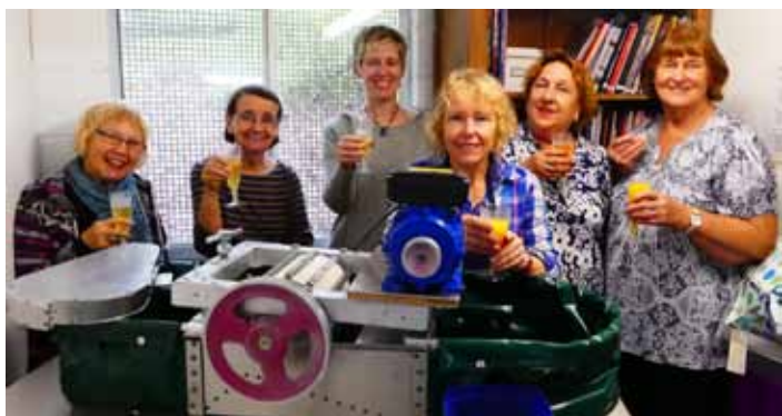
Papermakers and artists of Queensland celebrate their new Hollander beater

Papermakers and Artists of Queensland PAQ began as a group in 1993 with an exhibition on Papermaking at The Qld Museum during that time. Recently the name of the group has updated its name from Papermakers of Queensland to PAQ to acknowledge the wide range of interests members currently pursue. Group Shows and Exhibitions have been supported by numerous Regional Galleries and City Libraries. Last year we were the recipients of a Government community grant to purchase a Hollander-beater for the group.