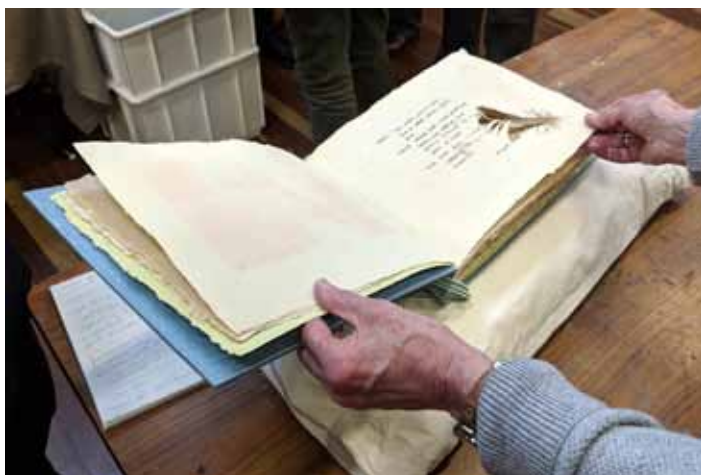
A closer look

In 1995, members began creating Limited Editions and a book (one of a Limited Edition of 10) was entered in the Exhibition 'Pulp Fiction', and in 1999, 30 members participated in the Limited Edition "Hands".