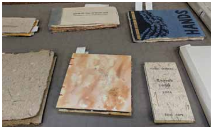
Books displayed for closer viewing

gave us a few up-to-the-minute rules about handling archival material. Although some liked to use white cotton gloves, clean, dry hands were the most important consideration when handling paper. Handling paper carefully with bare hands you can enjoy the tactile, as well as the visual experience. Gloves tend to rub paper. Rubber gloves are used when handling metal. When looking at books a pillow, filled with polystyrene beads, is used so that a book can rest open and the pages turned without straining the spine. Storing in plastic bags is acceptable these days but Helen showed us the purpose made cases (a phase box made from grey board) for individual items which are an unusual size and shape.