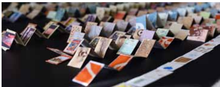
A side view of some of the 25 matchbox books