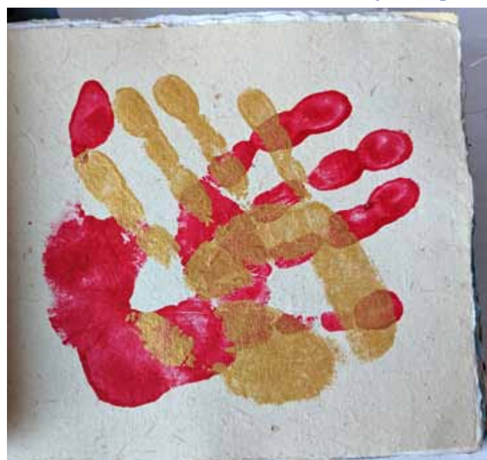
Gretchen Forrest Recycled mount board and wild oats, acrylic paint and gouache (in Hands Book)