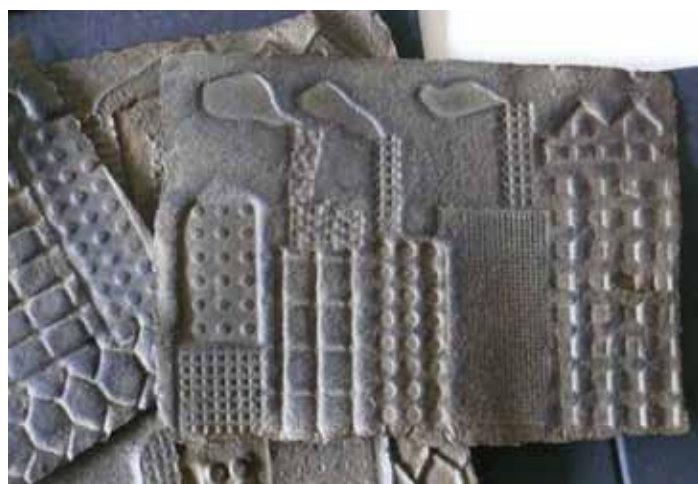
Gail Stiffe City Scape antiqued papers

During the first session you will learn how to make textured paper and to join sheets together in the wet stage to make a textured scroll or accordion book that you will treat with a decorative finish of your choice during the second session