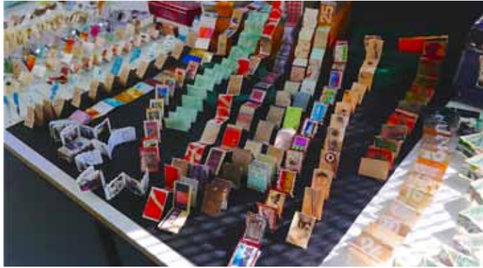
All out and about

Thus, it is with some small parcel of pride, I seek to deliver for your viewing pleasure at one of the Group's meeting, PAQ's tiny 25 th Anniversary show. [ There is a 'Big Brother' Artist Book Show, The In- Between in the near future.]