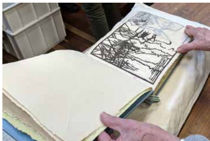
A closer look

Limited Editions were gaining popularity with members eagerly participating and in 2000 the new century was greeted with "Millenium", followed by "The Year of the Outback" in 2002 and in 2003, one book from Yabbers (PoV sub-group) Limited Edition (10) "Exquisite Corpse" went into the Archives. Every year after, members have continued to create beautiful handmade paper works (with one for the Archives) including commemorations of our 20th and 25th (Silver) Anniversaries, the innovative "Snake Book" and "Banana Bash" Limited Editions. This year, 29 members participated in a Limited Edition named "Journeys".