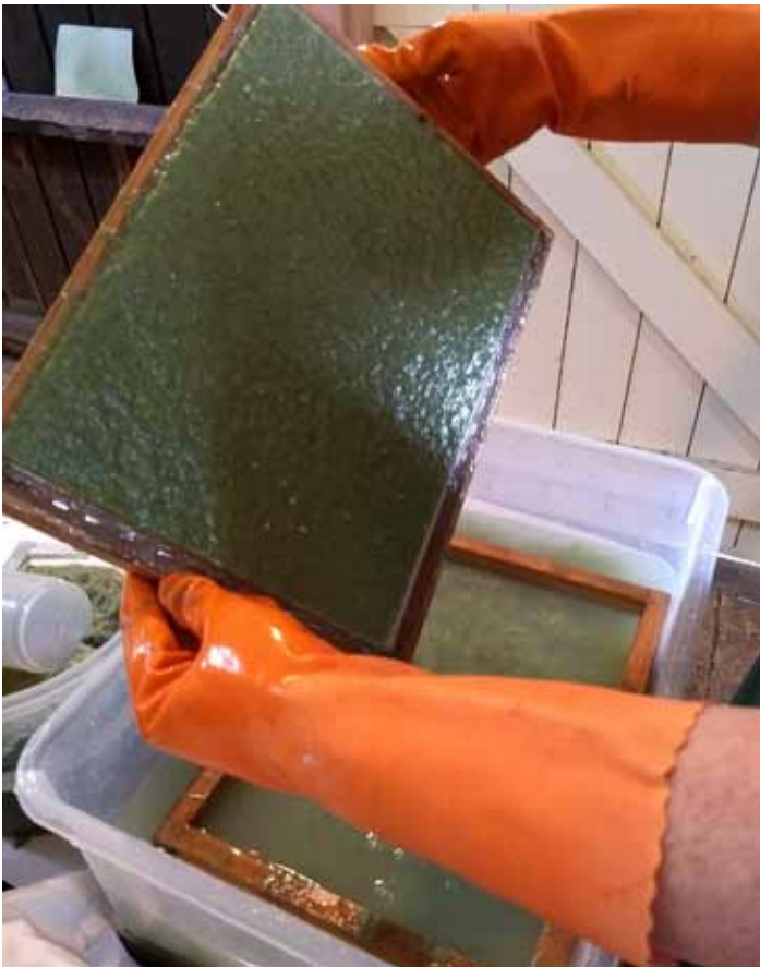
Stormy clouds overhead, papermakers work on undeterred and well rugged up. Photographs by Barb Adams from the Beginners' Paper-making workshop.