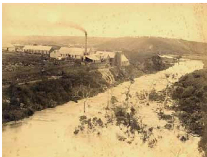
Barwon Paper Mill, with the Barwon River in flood, late 1880s http://justlovehistory.com Source: Wynd collection

The mill buildings themselves, on Lower Paper Mill Road, are also listed on the Victorian Heritage Database. The complex is judged to be significant for its role in the development of the Australian paper-making industry, and is one of the most significant surviving examples of a 19th century industrial complex in Australia. To quote the database: "This industrial complex, which was constructed mainly during the late 1870s and which comprises the original mill buildings, manager's house (1878), a row of six workers' cottages (1878), a stone water race with impeller, tower and stone weir, has both state architectural and historical significance sufficient for its inclusion on the historic buildings register." It is also classified by the National Trust and is on the Register of the National Estate. Today, the complex is being developed as an arts and cultural precinct.