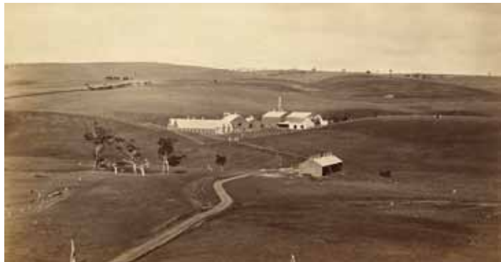
Fyansford Mill, c 1876