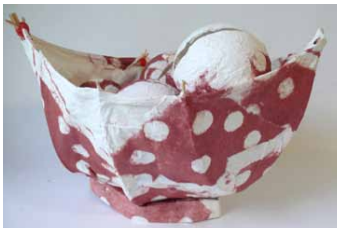
Gail recycled red and white hemp, pulp painted and wrapped around armature (work still in progress!)