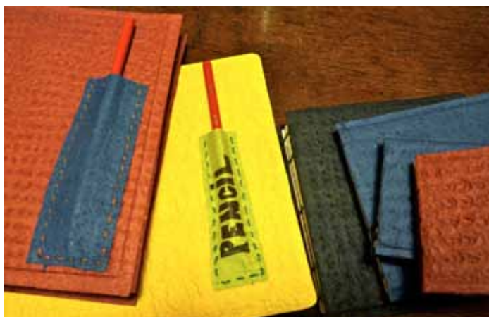
Barb Journals covers made from two sheets of the hemp paper sewn together.