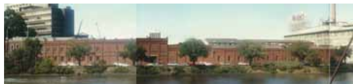
Panorama of the Australian Paper Mills Co Ltd, South Melbourne, 1986, just prior to demolition

Brookes and Currie had succeeded in amalgamating Victoria's three operating paper mills at South Melbourne, Fyansford and Broadford. The new entity became Australian Paper Mills Co Ltd (APM), in 1895.