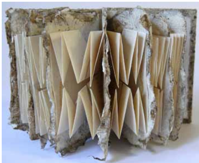
Gail Pearls of Wisdom both outer and inner sheets made from the recycled hemp. Inner sheets pressed and printed. Outer sheets unpressed with leaf litter and dirt sprinkled on while sheets were wet.