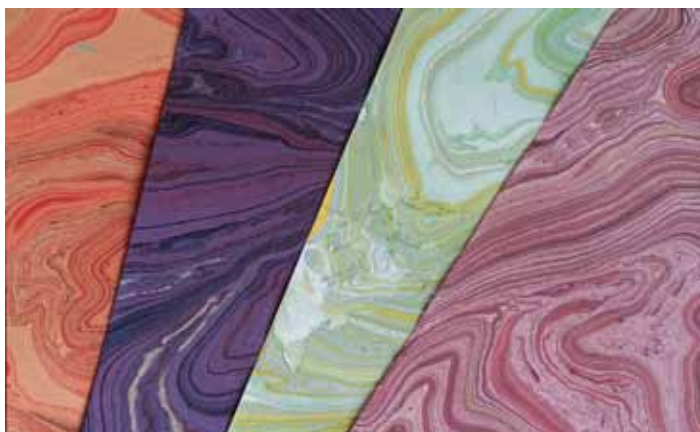
Just a few of the marbled sheets that come in a wonderful range of colours and patterns, all hand marbled using oil paints.

I realise that I haven't mentioned the marbled papers yet. There is a lovely range of oil marbled papers that would be excellent for end papers and for making cards and boxes.