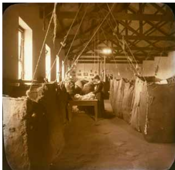
Rag sorting: paper mills Fyansford c1880

here are healthy enough. Although there is dust and dirt about, these girls still look smart, with an attempt at fashion in their attire."