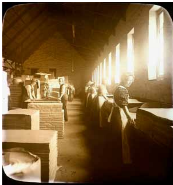
Examining sheets at Fyansford c1880 J.H.Harvey State Library of Victoria

At the time of the Vagabond's visit, the number of employees at the Fyansford mill had reached 70 to 80 and he observes that the sexes are "about equally divided". The role of women in production extended beyond the rag house: "The last stage in a paper factory is the cutting room, where the paper is cut into lengths, and sorted by young girls, who reject every dirty or speckled sheet."