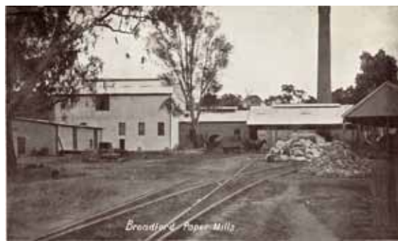
Broadford Paper Mills