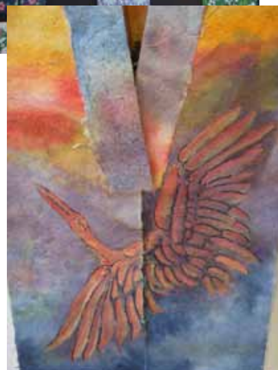
A selection of the Kimonos on display at the Box Hill Community Arts Centre

We would like to thank the City of Whitehorse and the BHCAC for this opportunity to exhibit these works as part of the Matsudo Week celebrations.