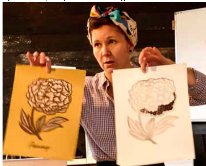
A collaborative work produced with Yupo stencils

Each veil can have different treatments contributing to the finished design. Yupo* can be cut into a stencil and laid onto the mould before forming the veil. Contact or masking tape may be cut into designs to block out the mould. Designs can be drawn into the veil with the jet of water from a dental syringe applied to the front or back of the mould. Trailing one's hand across the veil creates other effects. After a veil is couched into place other designs can be added by painting them onto vilene and gently pressing it face down onto the veil. The stack of veils is pressed before other designs, often very fine like a pencil line, are painted on using soft bristle brushes.