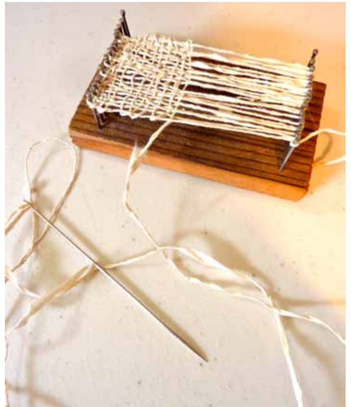
Weaving the shifu

We had the opportunity to colour our paper with ochres, indigo, persimmon and walnut ink before we spun it or made it into books. The pigments came in the form of sticks from SAIBOKU Pure Inorganic Pigment which we mixed with water to create the beautiful