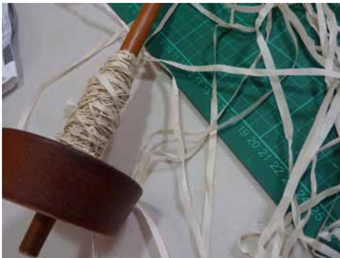
Paper strips ready to be spun

colours. The walnut crystals and pigment sticks are available from www.johnnealbooks.com .