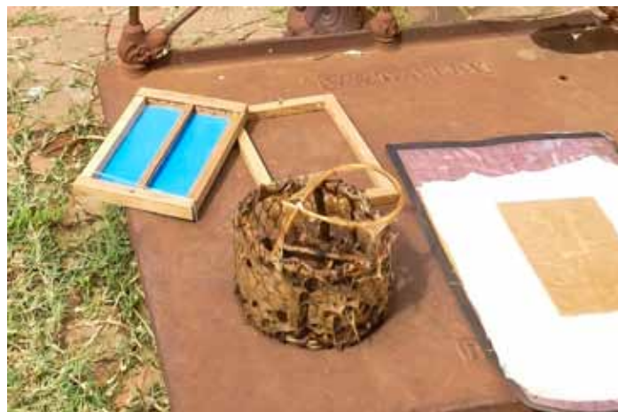
Ginger lily paper, Yabbers day at the Stables