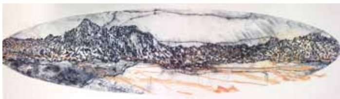
Lithosphere Mars 1