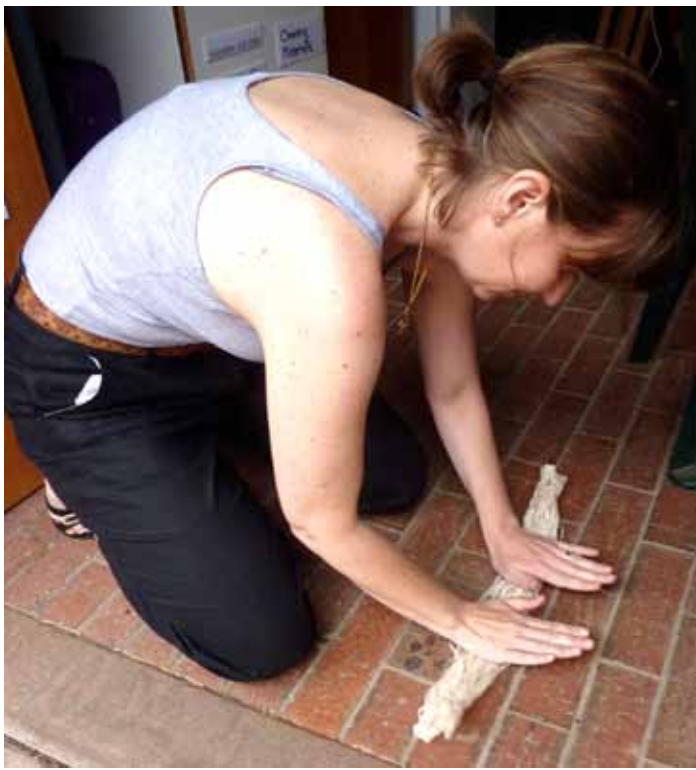
Rolling out the paper