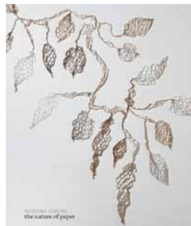
Catalogue Cover and below: installation view of the exhibition

Catalogues are available from the Museum & Art Gallery of the NT for $40. www.magnt.net.au/#!/product/prd17/4476149451/winsome-jobling%3A-the-nature-of-paper